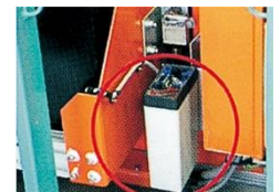
Sensor laser (Up-down)

Whether the model Side camps or other twin-fog models that are part of our product line-up can be handling any size.