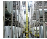
For paper roll