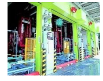
For hazardous goods