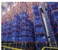
For frozen storage up to -60^{\circ}\text{C}

We are ready to serve you with years of experience in a wide variety of businesses. IHI's ASRS manages to cover various warehousing e.g., hazardous material storage. Frozen or chilled products, Heavy objects, and even spherical or cylindrical objects. Moreover, including storing unique specimens or storing in special environments.