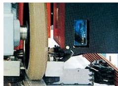
Polyurethane wheels and aluminum

Use a laser distance meter to determine running and landing positions. High accuracy with real-time measurement