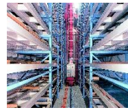
For heavy load such as steel plate