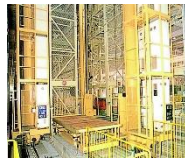
For heavy material