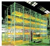
For mold storage