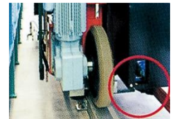
Sensor laser (rangefinder)

less noise while working due to the use of polyurethane wheels and aluminum rail